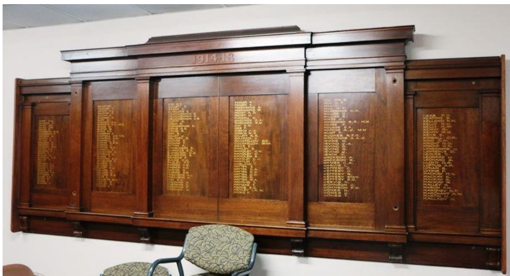
Moss Vale Roll of Honour